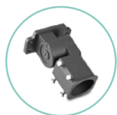
Slip Fitter Mount