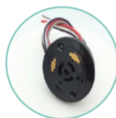
Photo sensor receptacle