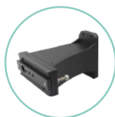
Direct Arm Mount